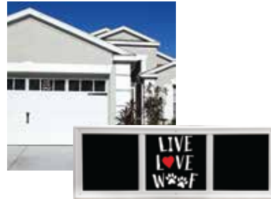
Live. Love. Woof.